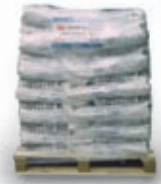
60 bags/pallet (1200 kg)