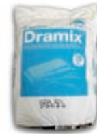
bags: 20 kg