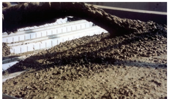
Concrete time savings by using Kingspan MD 60 metal deck and Dramix® reinforced concrete.