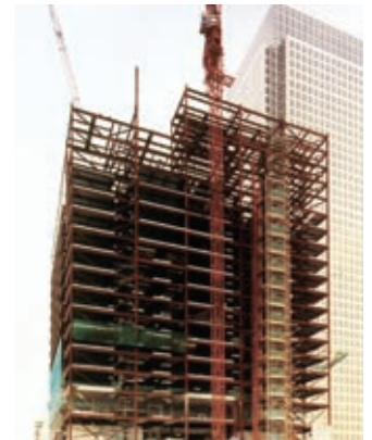
High tech multi-storey applications.